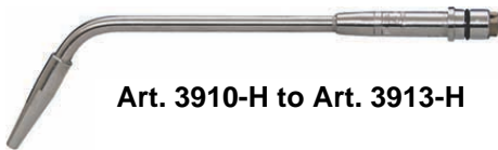
Art. 3910-H to Art. 3913-H

For soldering work with natural gas/oxygen, for calorific value from 3'100 to 13'500 kJ/h, flame temperature max. 2785°C. Soldering head No 1 Art. 3911-M Soldering head No 2 Art. 3912-M Soldering head No 3 Art. 3913-M Soldering head No 4 Art. 3914-M Soldering head No 5 Art. 3915-M