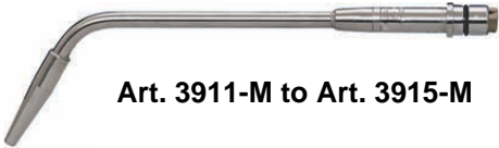
Art. 3911-M to Art. 3915-M

For general soldering work with propane/oxygen, for calorific value from 9'700 to 38'800 kJ/h, flame temperature max. 2830°C. Soldering head No 1 Art. 3911-P Soldering head No 2 Art. 3912-P Soldering head No 3 Art. 3913-P Soldering head No 4 Art. 3914-P Soldering head No 5 Art. 3915-P